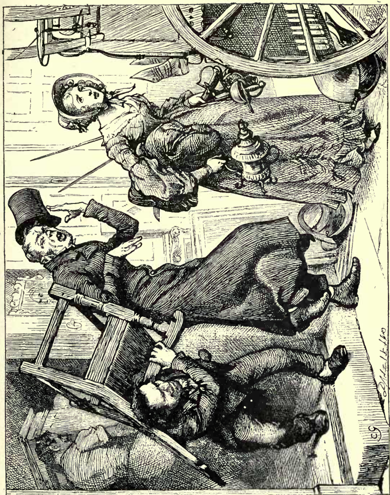
MR. QUILP WENT TO WORK WITH SURPRISING VIGOUR.